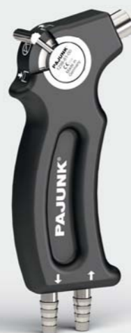
FlowSys Ergo Gun Handle